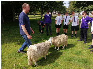
Spend time in nature