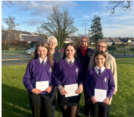
Connect with your community